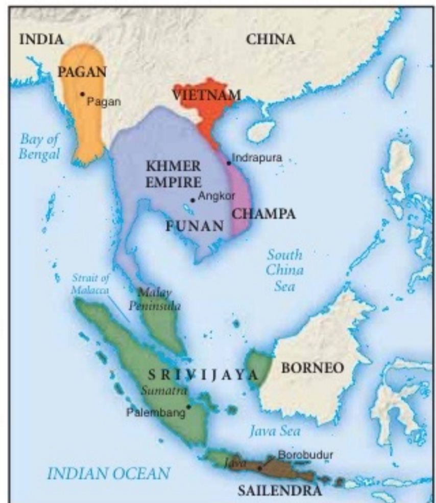
Map 7.3 Southeast Asia ca. 1200 C.E. Both mainland and island Southeast Asia were centrally involved in the commerce of the Indian Ocean basin, and both were transformed by that experience.

Politically, Southeast Asian rulers and elites found attractive the Indian belief that leaders were god-kings, perhaps reincarnations of a Buddha or the Hindu deity Shiva, while the idea of karma conveyed legitimacy to the rich and powerful based on their moral behavior in earlier lives. Srivijaya monarchs, for example, employed Indians as advisers, clerks, or officials and assigned Sanskrit titles to their subordinates. The capital city of Palembang was a cosmopolitan place, where even the parrots were said to speak four languages. While these rulers drew on indigenous beliefs that chiefs possessed magical powers and were responsible for the prosperity of their people, they also