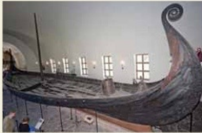
A Viking ship similar to that used by Thorfinn Karlsfeni and other Viking explorers.

Among those voyagers was Thorfinn Karlsefni, who set off from southern Greenland in the spring of 1007 bound for what he called Vinland, what we know as North America. A well-born, wealthy merchant and seaman of Norwegian Viking background, he had come the previous summer from his home in Iceland to the small Viking