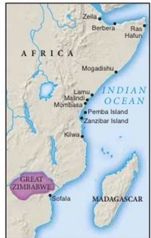
The Swahili Coast of East Africa

Islam sharply divided the Swahili cities from their African neighbors to the west, for neither the new religion nor Swahili culture penetrated much beyond the coast until the nineteenth century. Economically, however, the coastal cities acted as intermediaries between the interior producers of valued goods and the Arab merchants