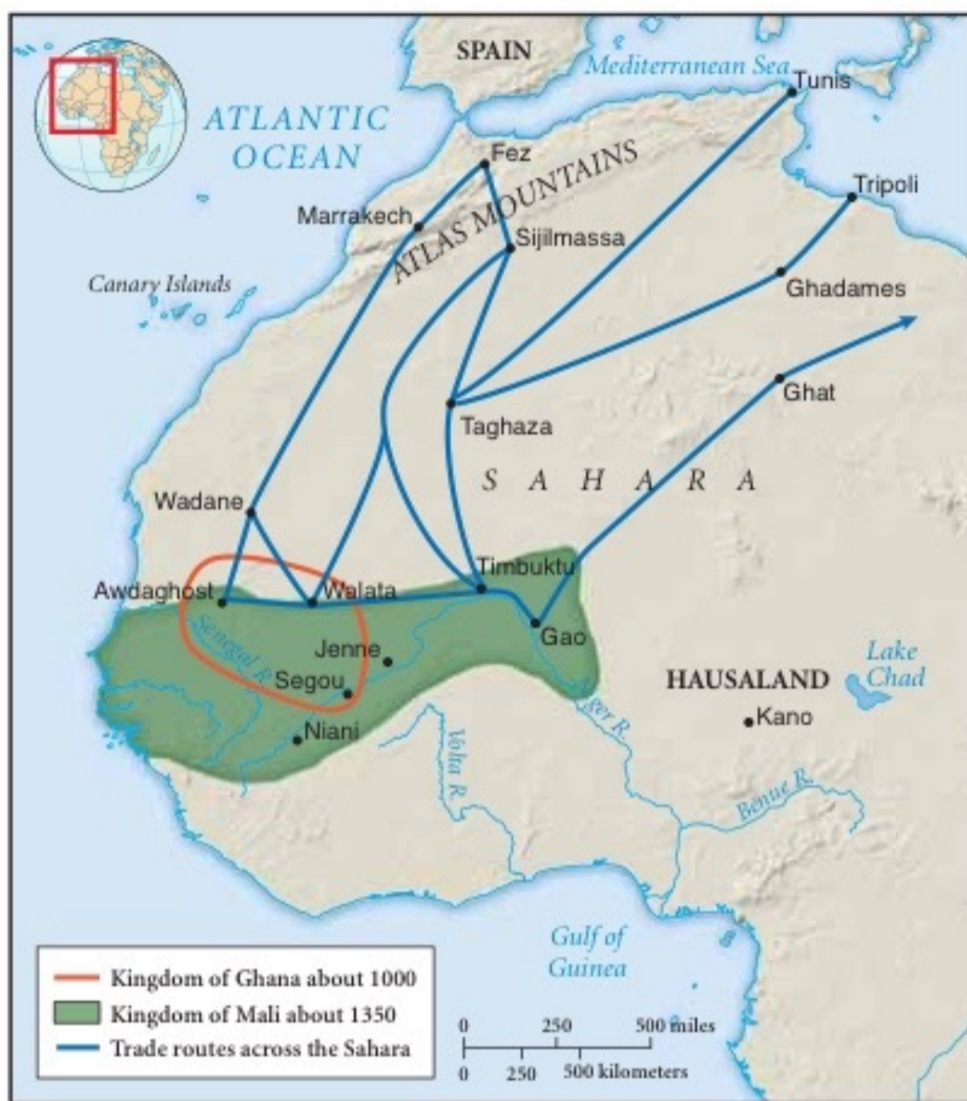
Map 7.4 The Sand Roads

For a thousand years or more, the Sahara was an ocean of sand that linked the interior of West Africa with the world of North Africa and the Mediterranean but separated them as well.