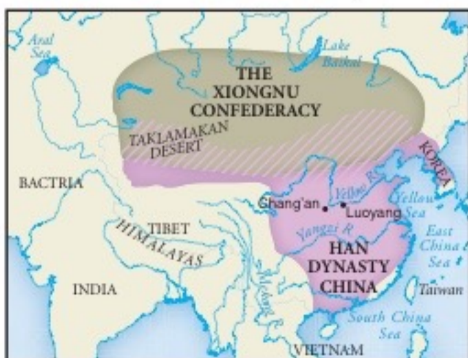
The Xiongnu Confederacy

One early large-scale nomadic empire was associated with the people known as the Xiongnu, who lived in the Mongolian steppes north of China (see Chapter 8). Provoked by Chinese penetration of their territory, the Xiongnu in the third and second centuries B.C.E. created a huge military confederacy that stretched from Manchuria deep into Central Asia. Under the charismatic leadership of Modun (r. 210–174 B.C.E.), the Xiongnu Empire effected a revolution in nomadic life. Earlier fragmented and egalitarian societies were now transformed into a far more centralized