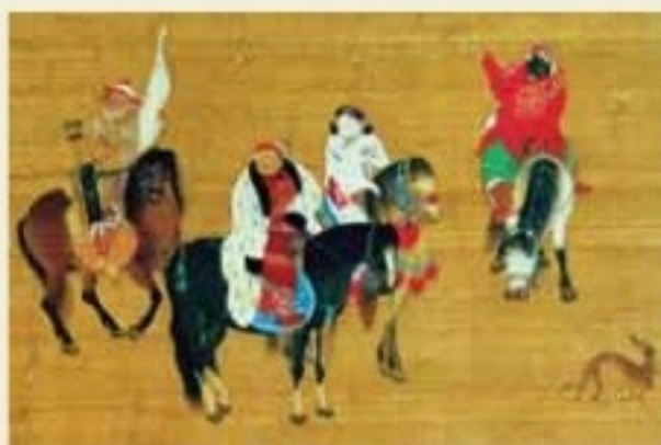
A Mongol woman riding with Chinggis Khan as Khutulun rode with her father.

B orn around 1260 into the extended family network of Chinggis Khan, Khutulun was the only girl among fourteen brothers. Even among elite Mongol women, many of whom played important roles in public life, Khutulun was unique. Her father, Qaidu Khan, was the Mongol ruler of Central Asia and a bitter opponent of Khubilai Khan, the Mongol ruler of China who was trying to extend his control over Central Asia. A large and well-built young woman, Khutulun excelled in horse riding, archery, and wrestling, outperforming her brothers. Winning fame as a wrestler in public competitions, she soon joined her father on the battlefield, was awarded a medallion of office normally reserved for men alone,