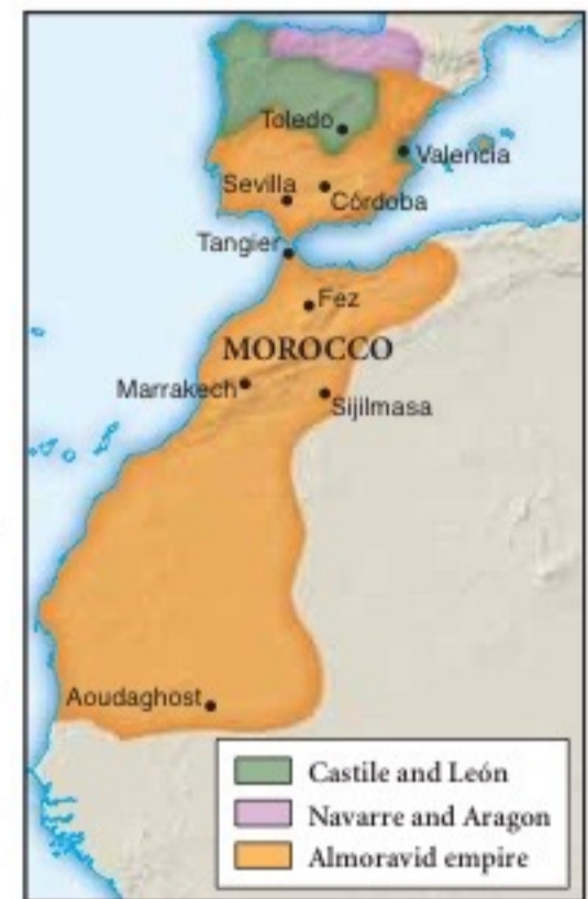
The Almoravid Empire

For a time, the Almoravid state enjoyed considerable prosperity, based on its control of much of the West African gold trade and the grain-producing Atlantic plains of Morocco. The Almoravids also brought to Morocco the sophisticated Islamic culture of southern Spain, still visible in the splendid architecture of the city of Marrakesh, for a time the capital of the Almoravid Empire. By the mid-twelfth century, that empire had been overrun by its long-time enemies, Berber farming people from the Atlas Mountains. But for roughly a century, the Almoravid movement represented an African pastoral people, who had converted to Islam, came into conflict with their agricultural neighbors, built a short-lived empire, and had a considerable impact on neighboring civilizations in both North Africa and Europe.